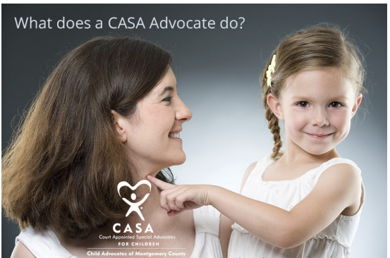
What does a CASA Advocate do?